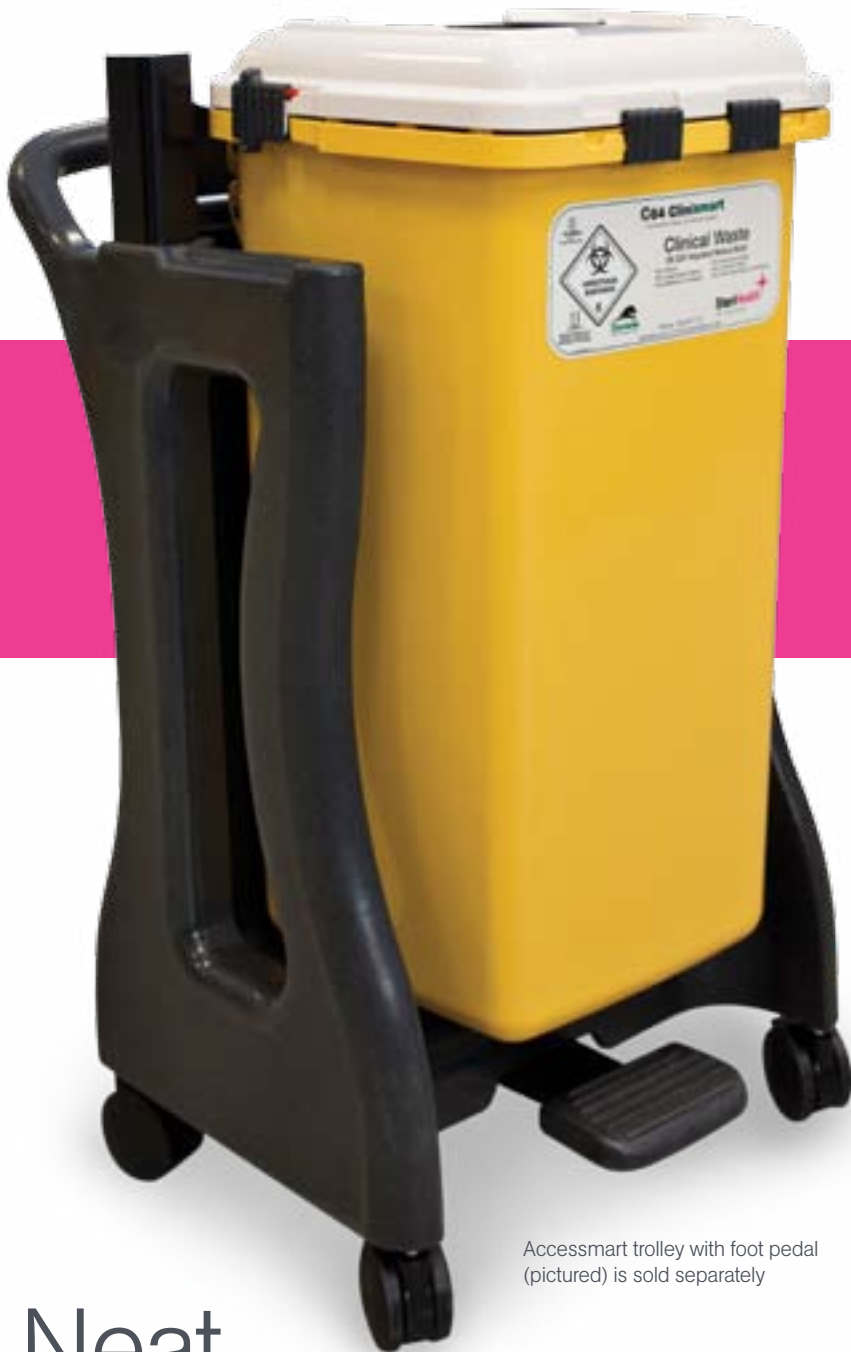
Accessmart trolley with foot pedal (pictured) is sold separately